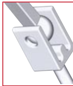
Easy bendable shaft due to ball joint.

Material: Titanium (ASTM F67 Medical Grade) Diameter: 0.4 / 0.6 mm